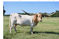
SOUTHERN STAR 110