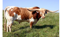
MY MY MY