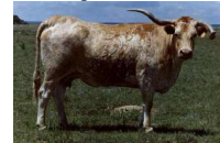
3S Classic Favorite