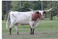
LS Princess 515