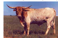
PINON WHIP CREAM