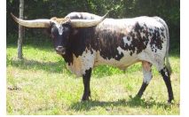
Horseshoe J Charm