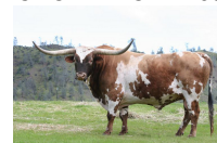
SR DIEGO'S DARLING