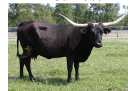
CROWN ROYAL 007