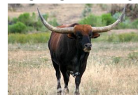
MISS RODEO AMERICA