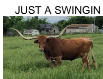
JUST A SWINGIN