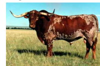
KING'S LYNN JWT