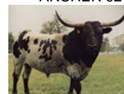
TEXANA POSSUM SPOT