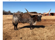
HUNTS MISS LEATHALWEAPON