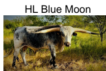
HL Blue Moon