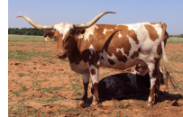
HUNTS COMMAND RESPECT