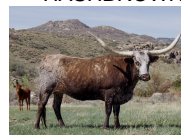
IMPACTS REAR ADMIRAL