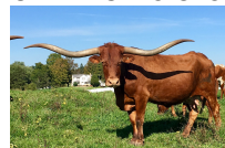
HUNTS COMMAND RESPECT