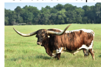
HUBBELLS RIO GLORY